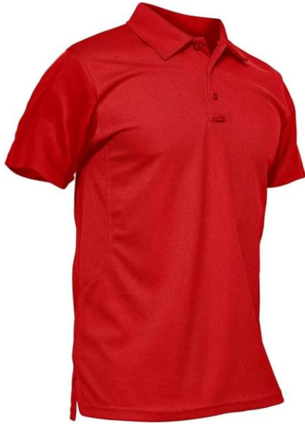
Red Polo Dry fit Shirt w/ Logo on Chest Area